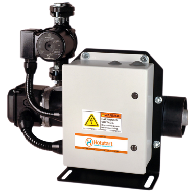
Figure 1 (Above). Hotstart CSM (type B) heating system showing tank assembly without sleeve component.

If you have questions about this product change or would like further information about the CSM heating system model options, please contact Hotstart Customer Service at 509.536.8660 or sales@hotstart.com .