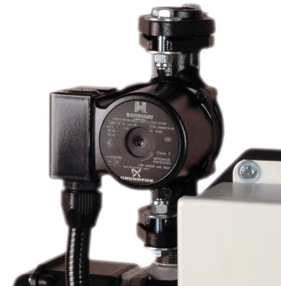
Figure 3. The HOTSTART CSM, showing pump label. This label displays pump information, including efficiency rating.

All HOTSTART CSMs are manufactured to meet either CE or UL requirements. All CE-marked CSMs manufactured after August 1, 2015 must incorporate high-efficiency pumps. If your CSM heating models bear other regulatory marks (such as UL), they are not required to have a high-efficiency pump beyond this date.