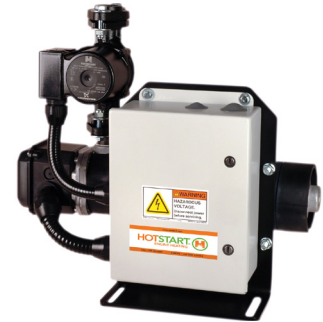
Figure 1. The HOTSTART CSM, showing a flange-style, pump. CSM configuration may vary.

The new pump specifications, including power source requirements, flow, and ingress protection remain equivalent to current CSM pump specifications; they are identical in form and function. However, all new high-efficiency pumps are installed via union-style connections only. Union-style pump dimensions are slightly different than their flange-style equivalents. When converted, this may result in an approximate 1.5 inch (38 mm) decrease in the CSM overall height – specifically the distance from the base of the unit to the pump outlet. Customers converting from a flange-style pump to a union-style pump may need to reroute or adjust the CSM return line plumbing to account for the height decrease. Other specifications, such as outlet size, are unchanged.